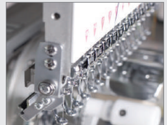
UPPER THREAD HOLDING SYSTEM

1) Productivity is improved by no decrease of speed even at jump stitching.