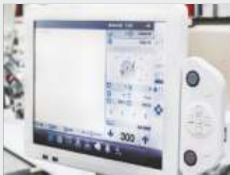
15.1 inch OP box