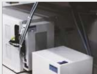
Main control box