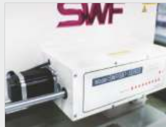
Improvement of color change structure