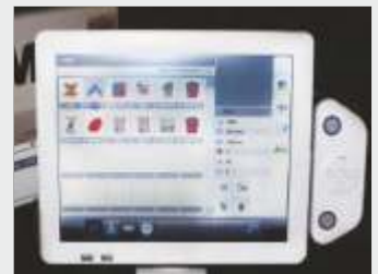
Improvement user convenience